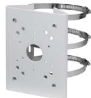
PFA150 Pole mount